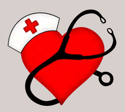
NURSES WEEK MAY 6 - MAY 12