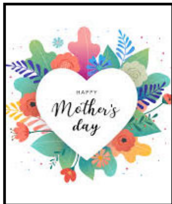
Mother's Day is Sunday May 14th!