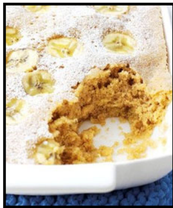
Enjoy Microwave Banana Pudding!