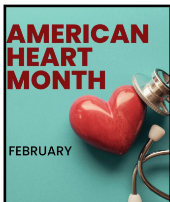
February is Heart Month