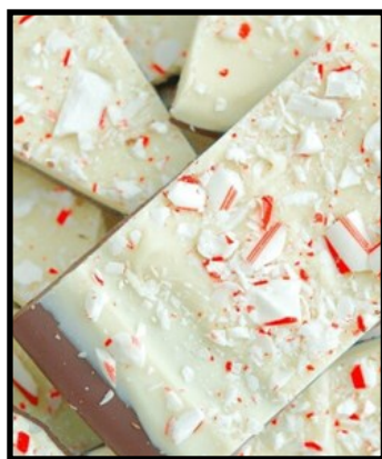
Enjoy some peppermint bark!