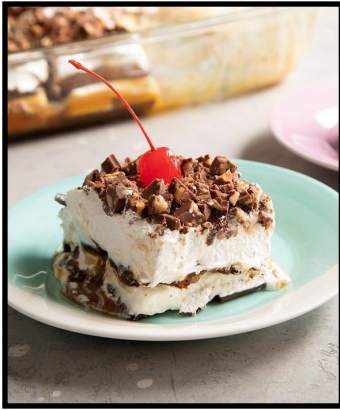
Ice Cream Sandwich Cake...Yum!