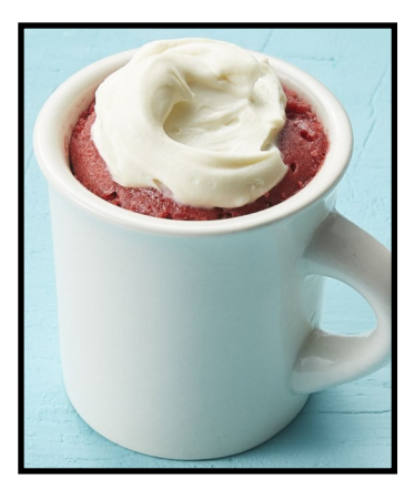
Red Velvet Mug Cake Recipe