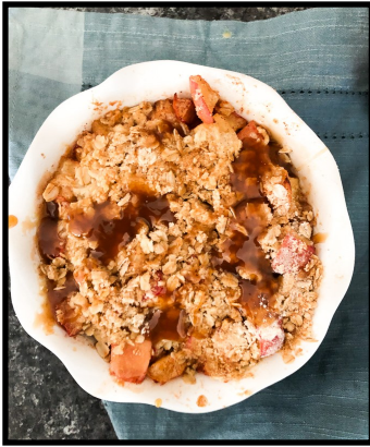
Air Fryer Apple Crisp