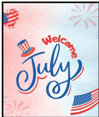
Read all about July!