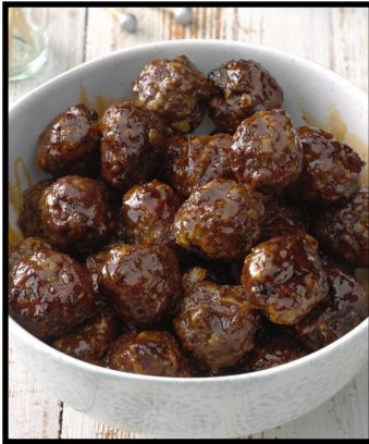
Air Fryer Sweet and Spicy Meatballs