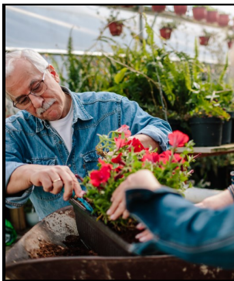
Will April Showers Bring May Flowers?