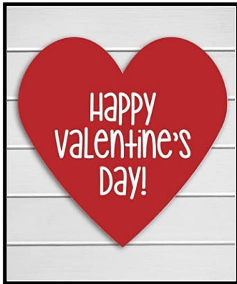
Valentine's Day History and Heart Health