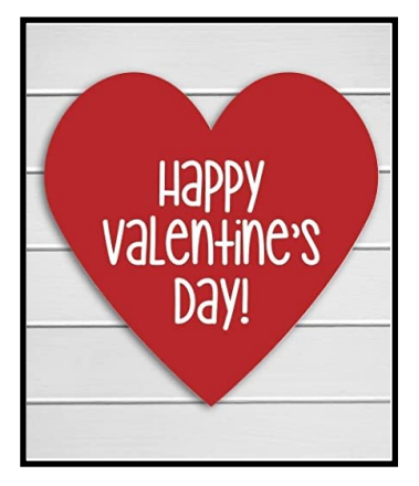
Valentine's Day History and Heart Health