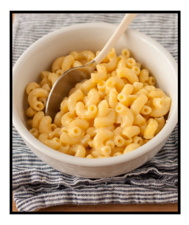
Microwave Mac 'n' Cheese is a must!