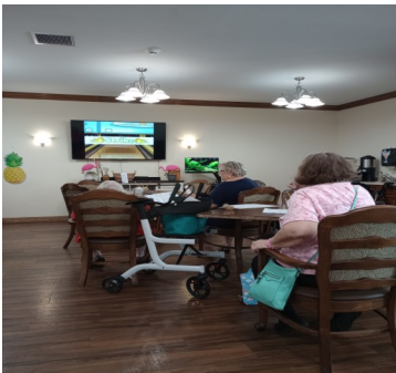
Wii Bowling has been fun watching newbies cheering them on and seeing them improve.