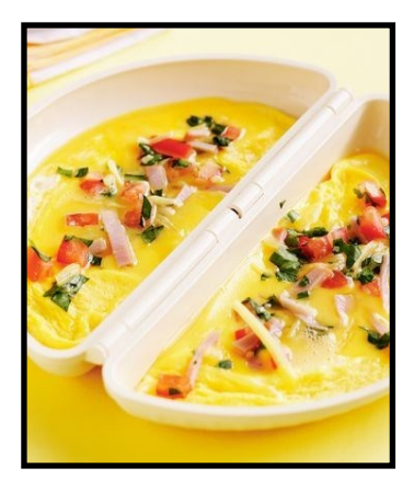
Enjoy a ham and tomato omelette!