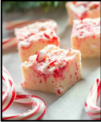
Candy Cane Fudge