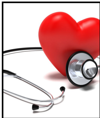
February is Heart Health Month