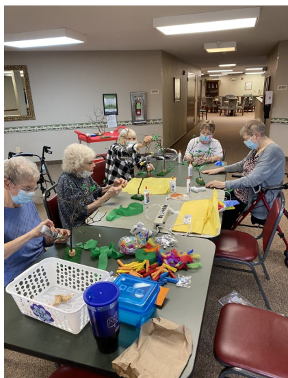
Crafting it up on a Thursday afternoon