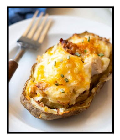
Air Fryer Twice Baked Potatoes