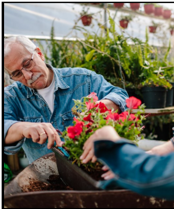
Will April Showers Bring May Flowers?