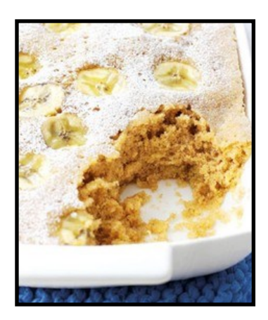
Enjoy Microwave Banana Pudding!