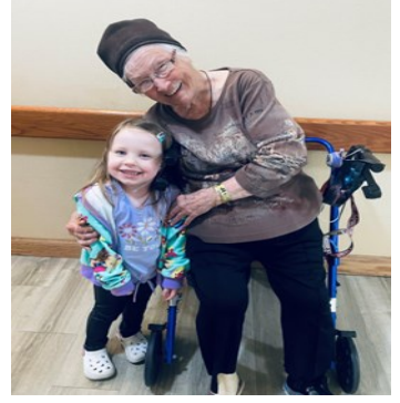
Looking forward to our Cinco De Mayo party.