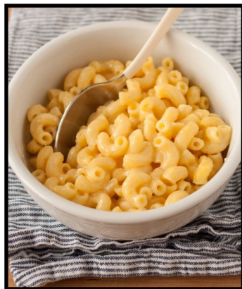
Microwave Mac 'n' Cheese is a must!