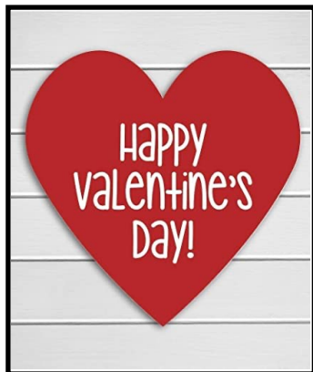
Valentine's Day History and Heart Health