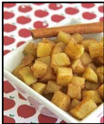
Microwave Cinnamon Apples are the Best!