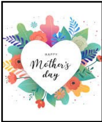
Mother's Day is Sunday May 14th!