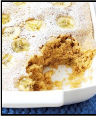
Enjoy Microwave Banana Pudding!