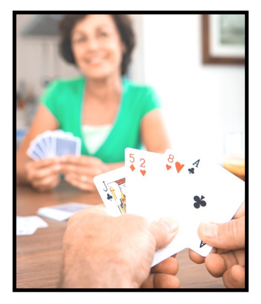
Benefits of Playing Games