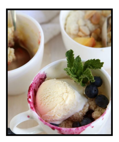
Microwave Fruit Crisp for Spring!