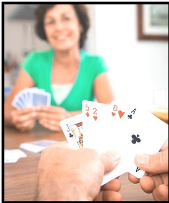
Benefits of Playing Games