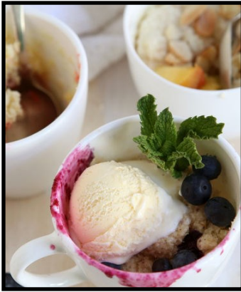
Microwave Fruit Crisp for Spring!