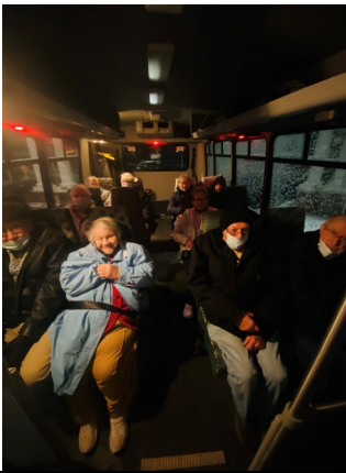
Festival Of Lights 2022

Below are some pictures of the fun we have had over the last month of 2022. We are so excited for the New year!