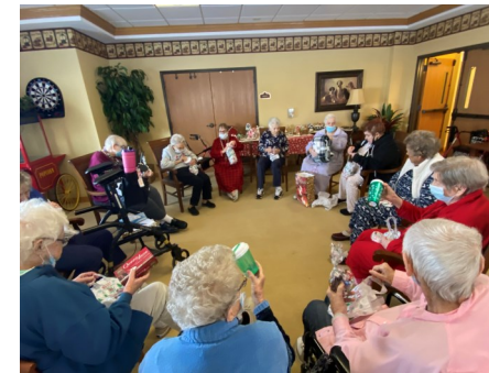
The whole gang playing a Xmas Right Left game. So much fun