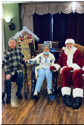
Xmas party 2022