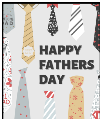
Father's Day is Sunday June 18th!