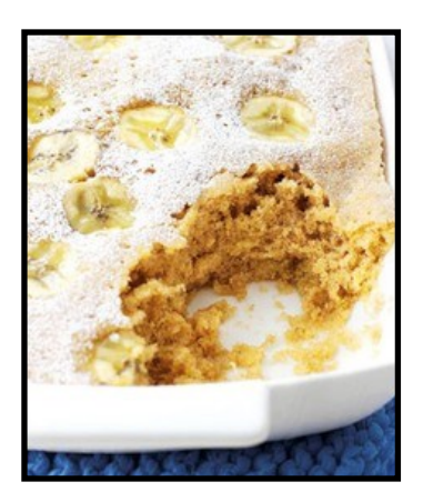
Enjoy Microwave Banana Pudding!