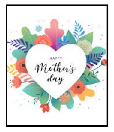
Mother's Day is Sunday May 14th!