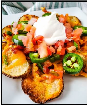
Irish Nachos for St. Patrick's Day!