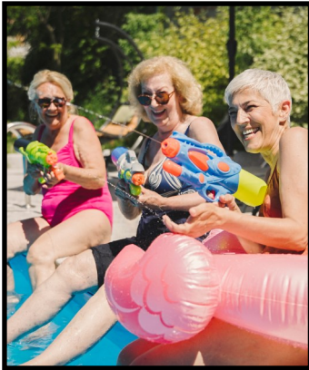
Stay cool this summer!