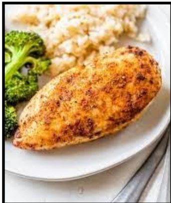
Try chicken breast in the air fryer!