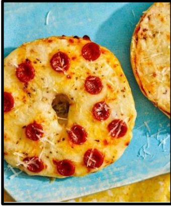
Pizza Bagels Recipe!