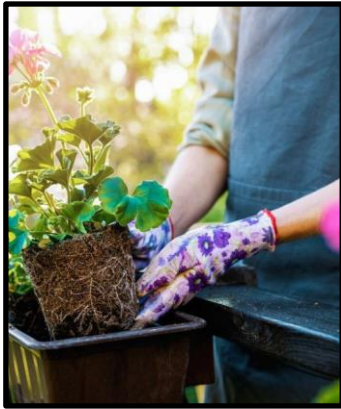
April is Gardening Month!