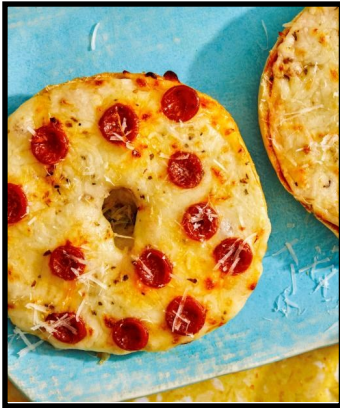
Pizza Bagels Recipe!