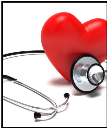
February is Heart Health Month