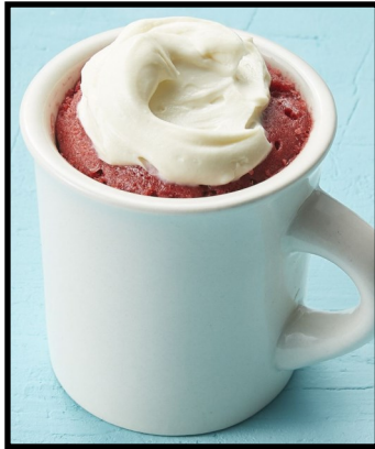
Red Velvet Mug Cake Recipe