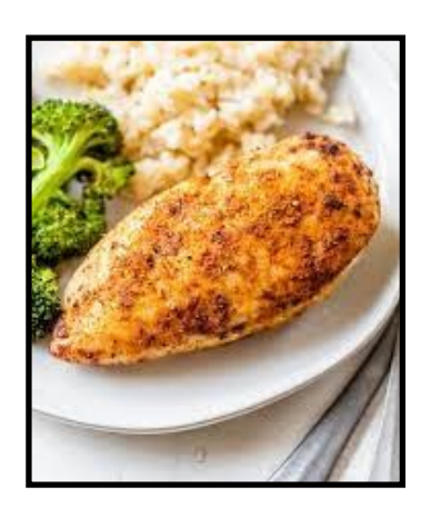
Try chicken breast in the air fryer!