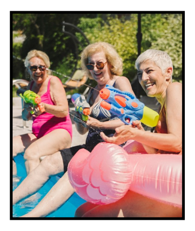
Stay cool this summer!