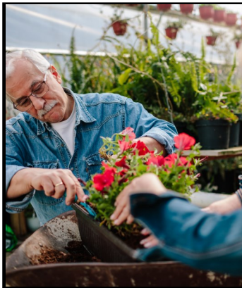
Will April Showers Bring May Flowers?