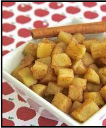
Microwave Cinnamon Apples are the Best!