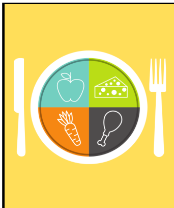
March is National Nutrition Month!