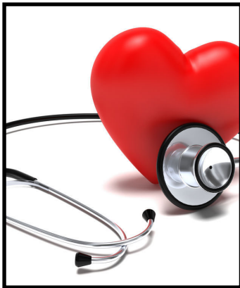
February is Heart Health Month